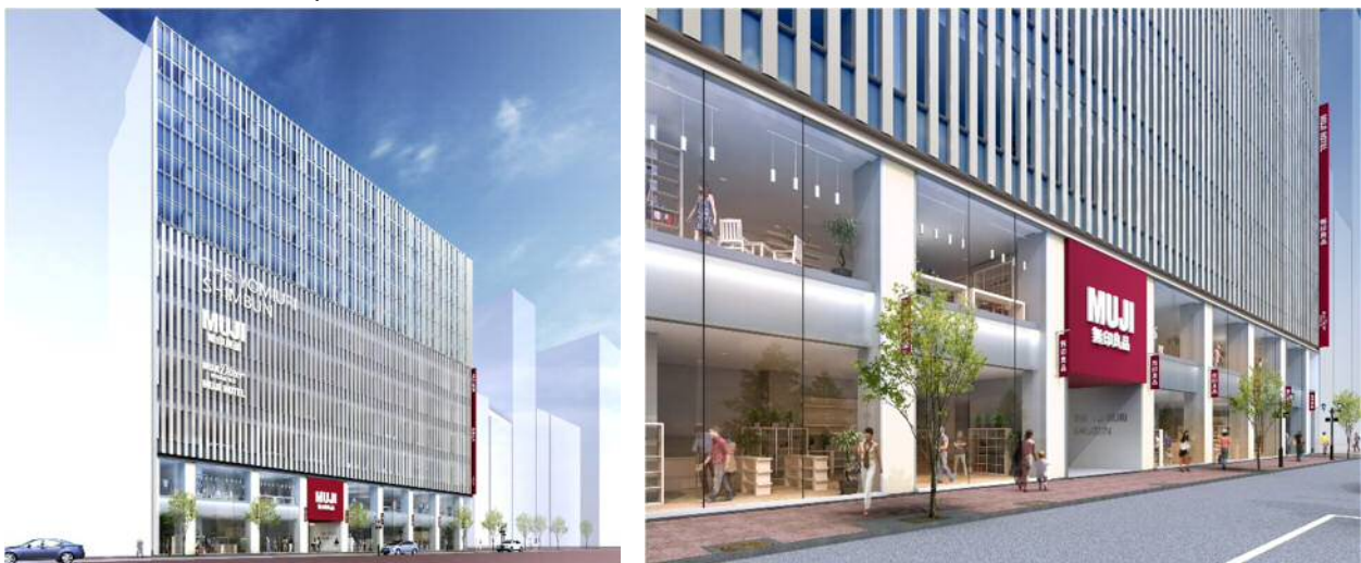
Artist's impression of exterior (left) and lower floor (right) from Namiki street